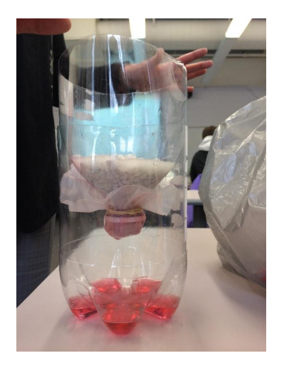
Figure 2. Example of 2L water filter after the experiment was run with Gatorade.